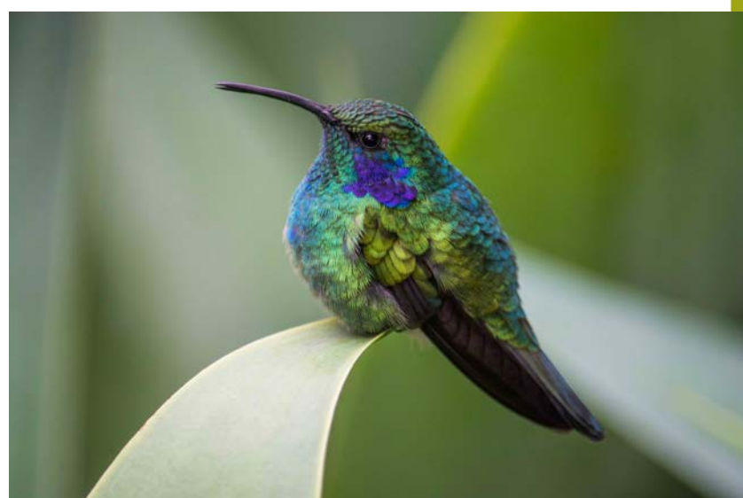
All Puffed Up by Elaine Manning