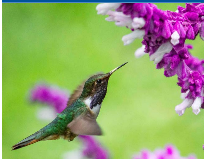
Volcano and Purple Sage Blooms by Elaine Manning

For more information, visit artsandhealth.duke.edu or call 919.684.6124